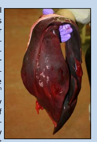
Figure 1. A flabby liver is a typical necropsy finding in

Equine serum hepatitis, also known as Theiler's disease, post-vaccinal hepatitis, acute liver atrophy, or idiopathic acute hepatic disease, was diagnosed in a 9-year-old horse at CAHFS. The horse had a 14 hour history of anorexia, incoordination, ataxia, running into walls, and icterus. At necropsy the liver was flabby (Figure 1) and had a diffuse enhanced reticular pattern. Centrilobular to panlobular hepatocellular degeneration, necrosis, and loss with associated non-suppurative hepatitis was diagnosed histologically. Theiler's disease is a common cause of acute hepatic failure in horses. It was first described in the early 20<sup>th</sup> century, however the etiology remains unknown to date. It is primarily a disease of adult horses characterized clinically by sudden onset of neurological signs (hyperexcitability, mania, continuous walking, circling, apparent blindness, ataxia) and jaundice, with death generally occurring in 6-24 hrs, although some horses recover after transient illness with jaundice. It is thought to be associated with injection of biologic products of equine origin (Clostridium spp. toxoids or tetanus cases of equine serum hepatiantitoxin, herpesviral vaccines, horse plasma, equine chorionic gonad- tis. otropin, etc.), but has also been reported in horses that have not received such injections.