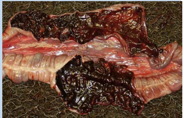
Diffuse hemorrhagic colitis (large colon open sections) in 1-day-old foal with C. perfringens type C and C. difficile co-infection.

portant cause of enterocolitis in horses of all ages; the most important predisposing factor being antibiotic treatment. While infections by C. perfringens type C or C. difficile are frequently seen in foals, diagnosis of concurrent infection by these two agents was rare. Because none of the foals had received antibiotic therapy, the predisposing factor for the C. difficile infection remains undetermined; it is possible that the C. perfringens infection acted as a predisposing factor for C. difficile or vice versa. These cases also stresses the need to perform a complete diagnostic work-up in all cases of foal digestive disease even when one causative agent has already been identified.